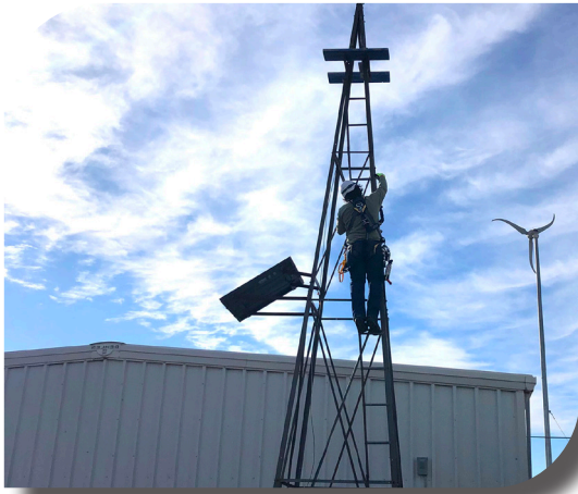
Students get hands-on experience during boot camps to enhance online learning.

Participation in Saturday “boot camps” is recommended to gain hands-on training. Our camps have state-of-the-art real-world systems (not mockups) to give students the necessary training needed to be successful in the industry. Boot camps are offered every eight weeks in the fall and spring semesters.